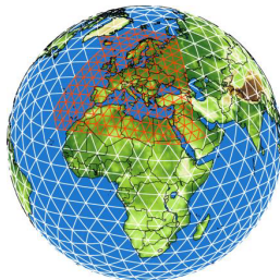
Example of global and nested model domain

The nonhydrostatic global modelling system ICON (Zängl et al., 2014) is a joint development of German Weather Service (DWD) and Max Planck Institute for Meteorology (MPI-M) with local grid refinement down to grid spacing in the sub-kilometer range. It will be used for numerical weather prediction, climate projections and for research purposes. Since January 2016 ICON runs operationally at DWD for weather forecast on the global scale with a grid spacing of 13 km. The integrated modelling framework ICON-ART ( ICOsahedral Nonhydrostatic – Aerosols and Reactive Trace gases ) extends ICON by modules for gas phase chemistry and aerosol dynamics, and related processes (Rieger et al., 2015). ICON-ART is designed to account for feedback processes between meteorological variables and atmospheric trace substances.